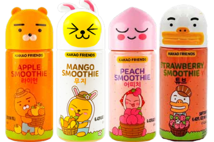
Wang Kakao Friends Smoothie 190 ml. Select flavors.