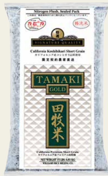
Tamaki Gold Short Grain Rice 15 lb.