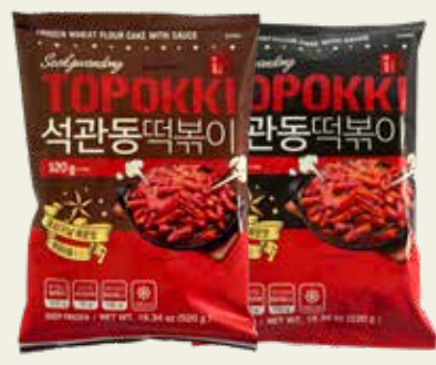
Orient Food Topokki 17.2-18.3 oz. Select variety. Frozen.