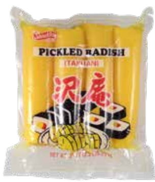
Shirakiku Takuwan 1 kg. Pickled radish.