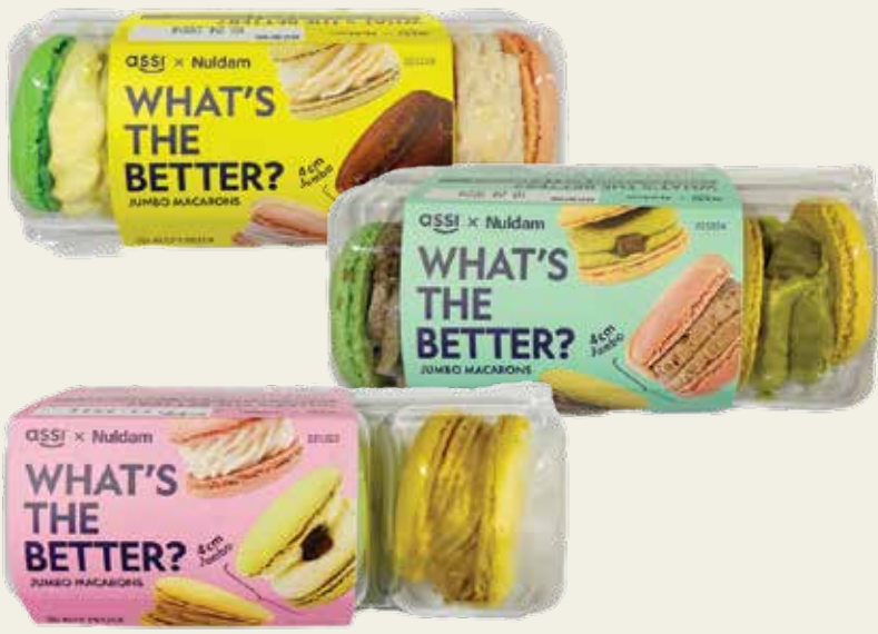
Assi Jumbo Macarons 5.82 oz. Select flavors. Frozen.