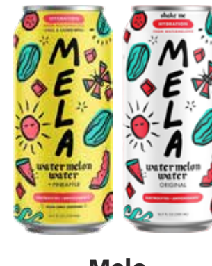
Mela Watermelon Water 16.9 oz. Original or pineapple.