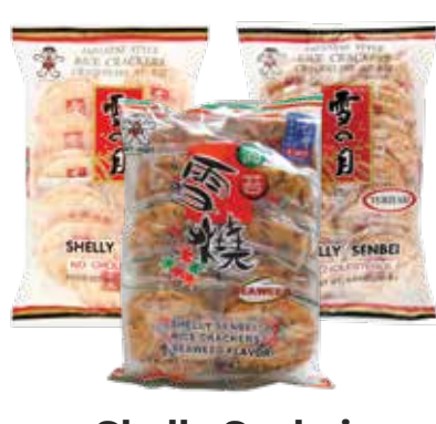
Shelly Senbei 5.3-5.6 oz. Regular, teriyaki or seaweed.