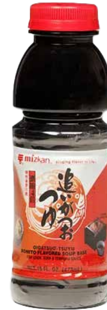
Mizkan Oigatsuo Tsuyu 16 fl oz. Bonito flavored soup base.