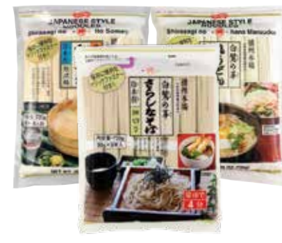
Shirakiku Japanese Style Noodles 25.39 oz. Select variety.