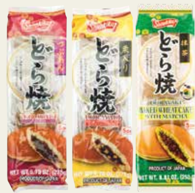
Shirakiku Dorayaki 5 pc. Select flavors. Frozen.