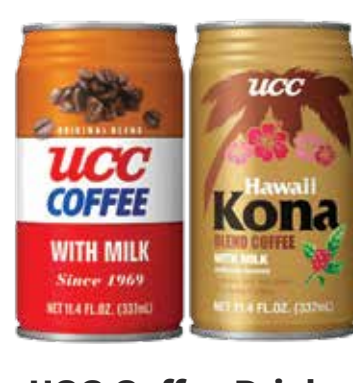
UCC Coffee Drinks 11.4 fl oz. Original blend with milk or kona blend with milk.