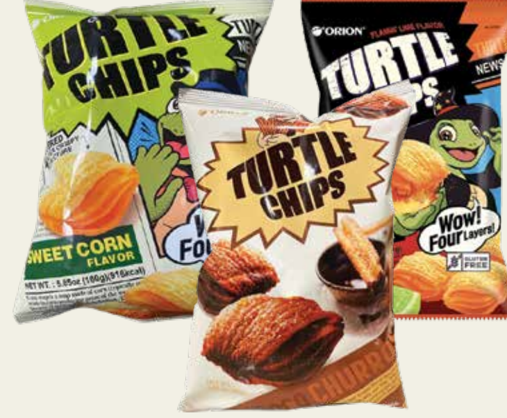
Orion Turtle Chips 160 g. Select flavors.