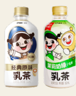
Chi Forest Milk Tea 360 ml. Original or jasmine.