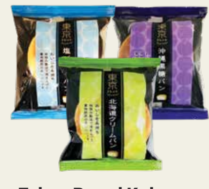
Tokyo Bread Kobopan 70 g. Select variety. Bread rolls made with natural yeast.