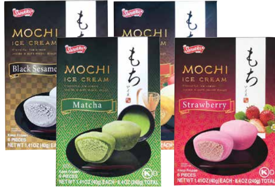
Shirakiku Mochi Ice Cream 8.4 oz. Select flavors. Frozen. $4.50 each.