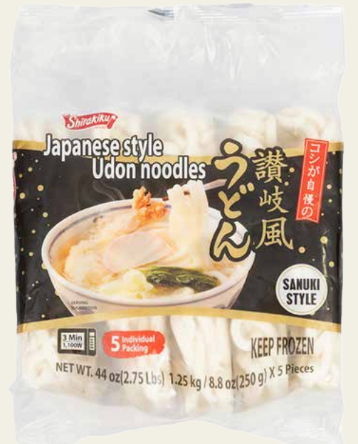
Shirakiku Premium Udon Noodles 5 pc. Frozen.