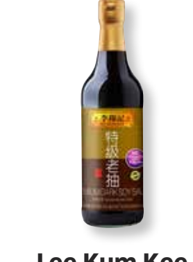
Lee Kum Kee Premium Dark Soy Sauce