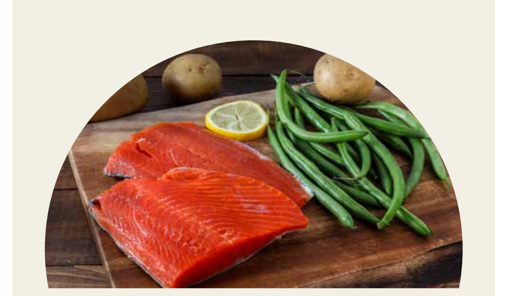
Sockeye Salmon Fillet Caught and processed immediately for the highest quality.