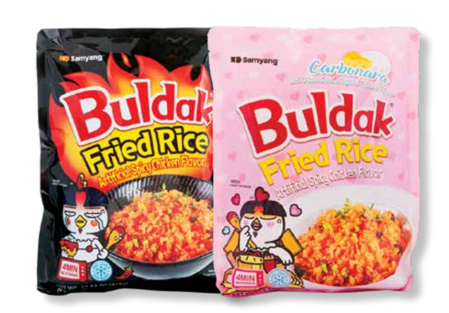
Samyang Buldak Fried Rice 440 gm. Frozen. Original or carbonara.