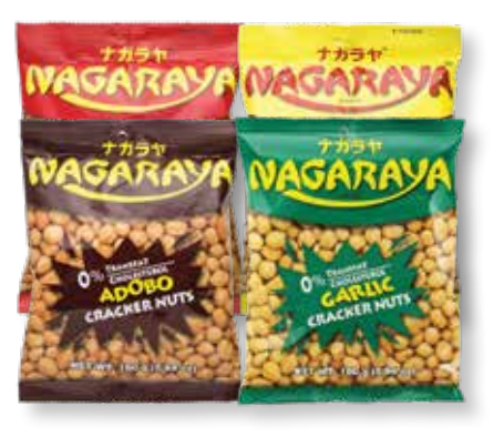
Nagaraya Cracker Nuts 160 gm. Select variety. 1.59