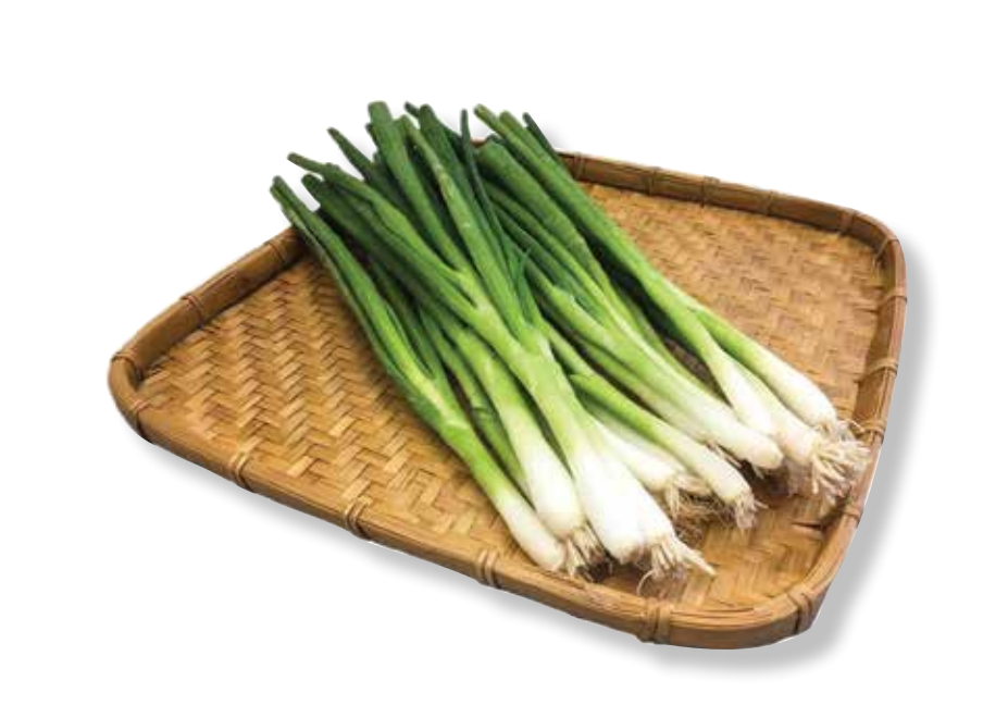
Green Onions Fresh! Useful in nearly any dish. Save up to 98¢ when you buy 2