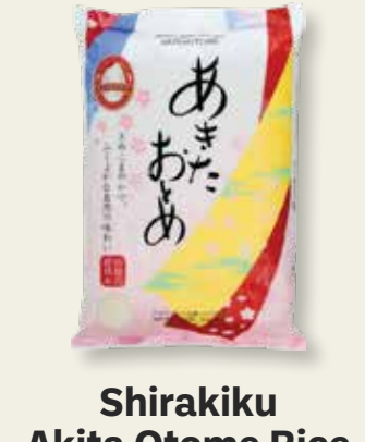
Akita Otome Rice 24.99 Save $9.00