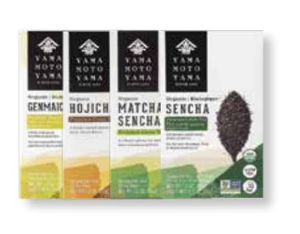
Yamamotoyama Organic Tea Bags 18 pk. Select variety. 4.79