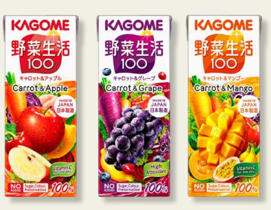
Kagome 100% Vegetable Juice 6.76 fl oz. Select flavors.