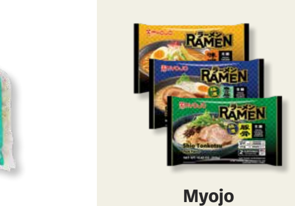
Fresh Ramen 2 pc. Frozen. Select flavors. 4.99 Save $2.50