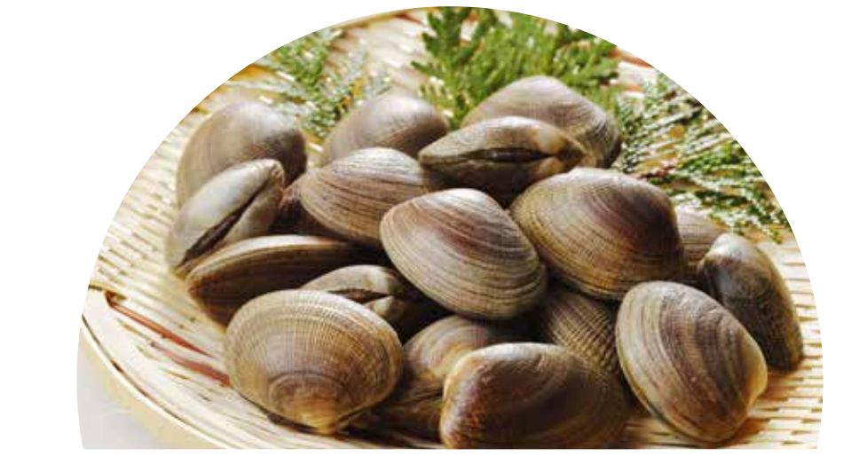
Live! Manila Steamer Clams Locally grown and delivered to our stores. Check them out in our live tank section!