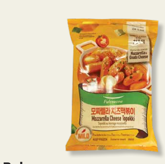
Pulmuone Mozzarella Cheese Topokki 14.1 oz. Frozen.