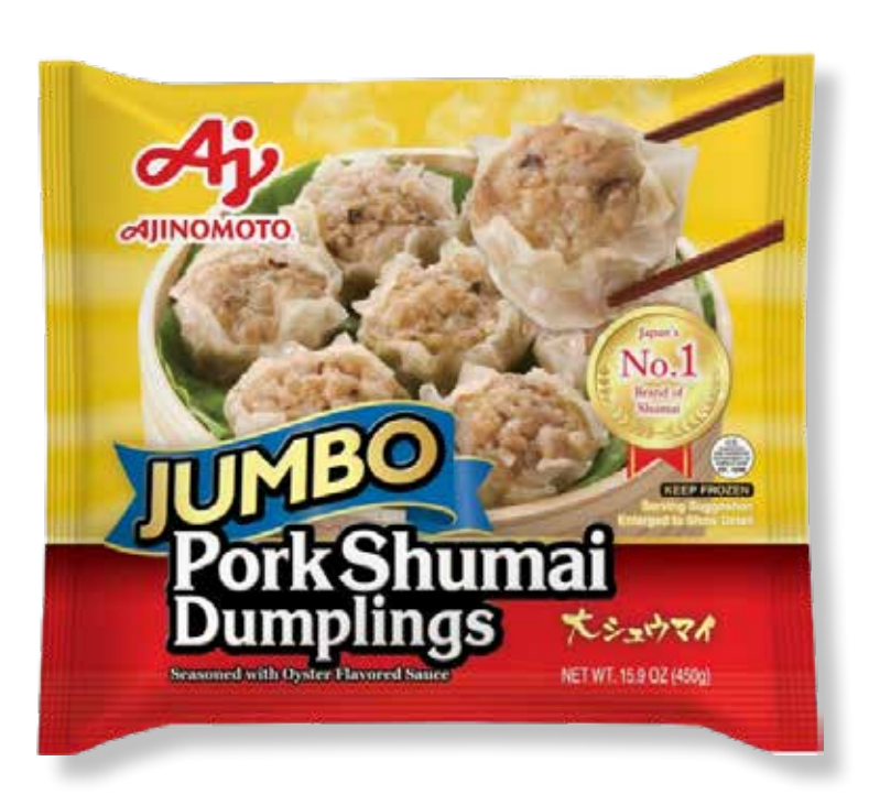
Ajinomoto Jumbo Pork Shumai 450 gm. Frozen.