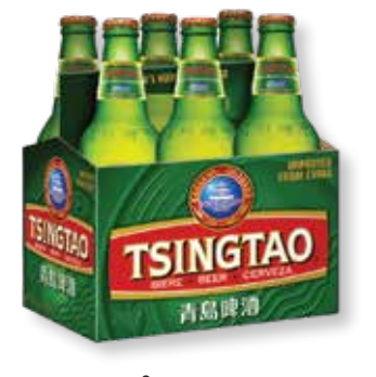
Tsingtao Lager Beer Bottle 11.99