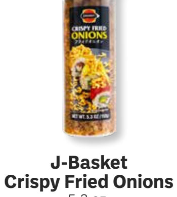
2.49 Save $1.00