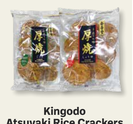
Atsuyaki Rice Crackers 9 pc. Goma or shoyu. 2.99 Save 50¢