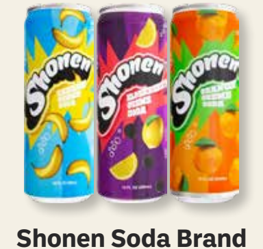
Fruits Soda 12 oz. Select flavors. 1.99