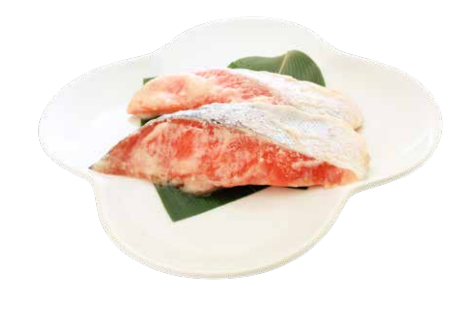
Kasuzuke Salmon Marinated with our sake lees recipe. Bake or broil for umami-packed flavor!