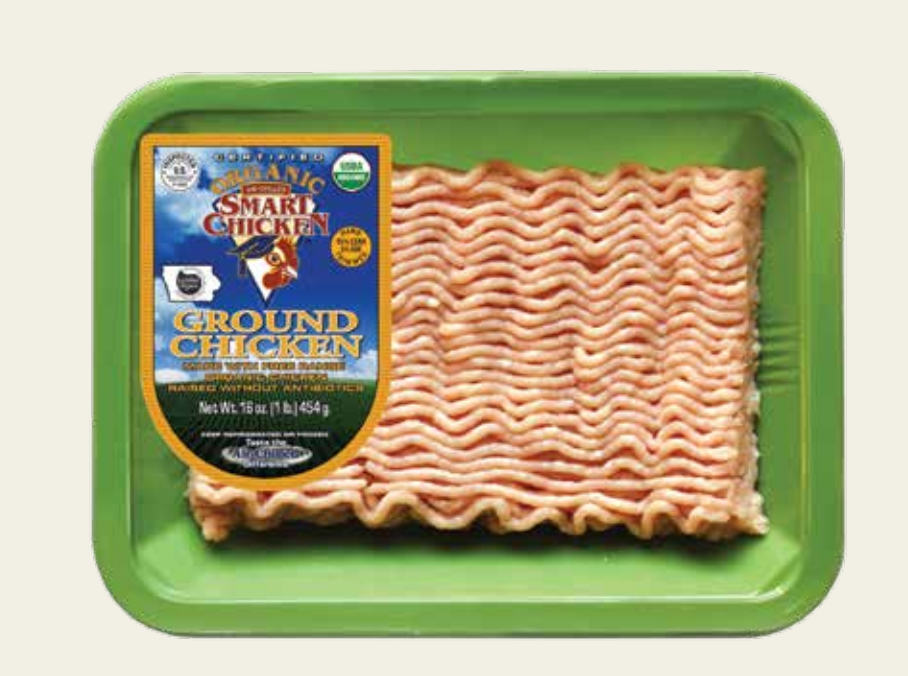
Ground Chicken Organic!