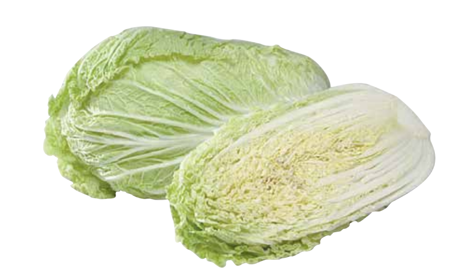
Nappa Cabbage Fresh! Use in hotpot, kimchi, and more.