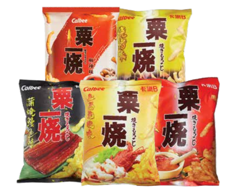
Calbee Corn Snacks 2.8 oz. Assorted flavors.