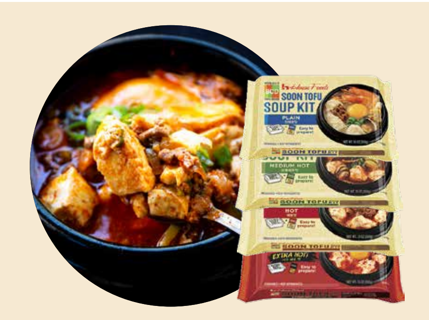
House Foods BCD Soon Tofu Kit 13 oz. Plain, medium hot, hot, or extra hot.

This hearty, spicy stew combines silky tofu, your choice of protein, and the vibrant kick of Korean pepper flakes. Perfect for warming up your taste buds!