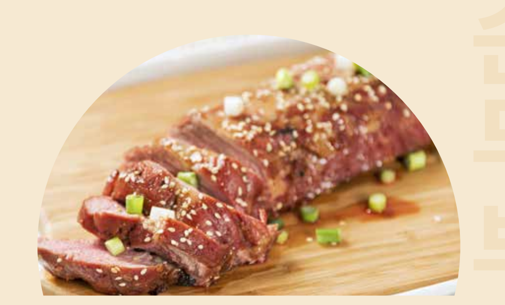
Pork Tenderloin Slice across the grain and add to soon dubu!