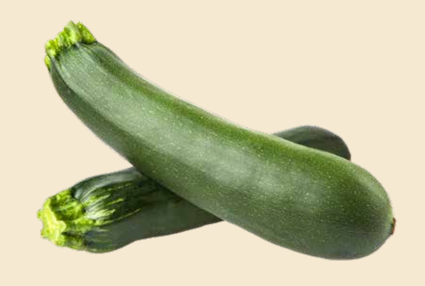
Zucchini Fresh! Great sautéed, roasted or in soups.