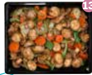
Mushroom Chicken 10.75 lb