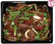
Mongolian Beef 15.95 lb