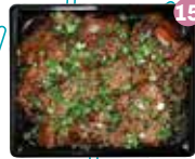
Chicken Teriyaki 11.95 lb