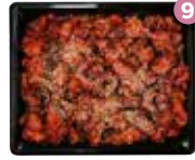
Honey Sesame Chicken 10.75 lb