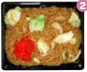
Yakisoba 6.95 lb