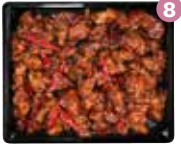
General Tsao's Chicken 10.75 lb