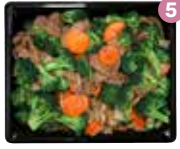
Beef & Broccoli 10.75 lb