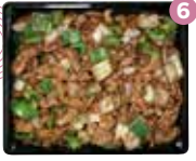
Garlic Pork 10.75 lb