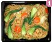
Chow Mein 6.95 lb

48 Hour Notice Required. Minimum Order of 5 lbs. 5 lb Tray Serves 6-10