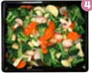
Stir-Fry Vegetables 8.95 lb