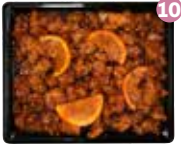
Orange Chicken 10.75 lb