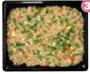
Fried Rice 6.95 lb