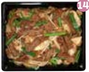
Beef Chow Foon 10.25 lb