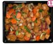
Spicy Tofu Chicken 10.75 lb