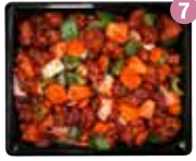
Sweet & Sour Pork 10.75 lb