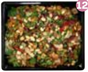
Kung Pao Chicken 10.75 lb